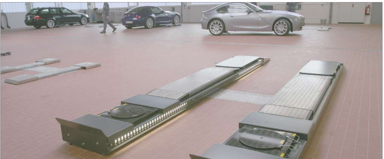
The workshop is equipped with 28 Nussbaum-In-ground lift, Top Lift, with different lifting possibilities.

The car dealer Krauth BMW opened on March 2nd, 2007 in Heidelberg (Germany).