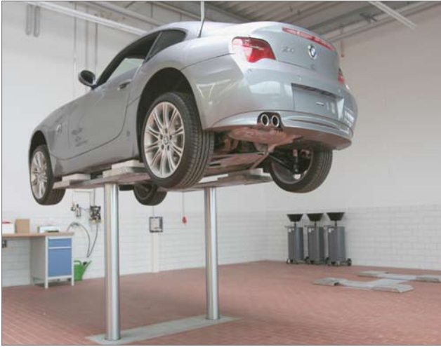
Top Lift 2.35 TS NT