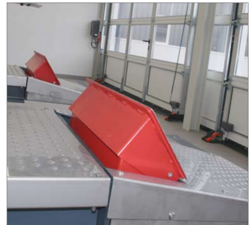
roll-off safety device