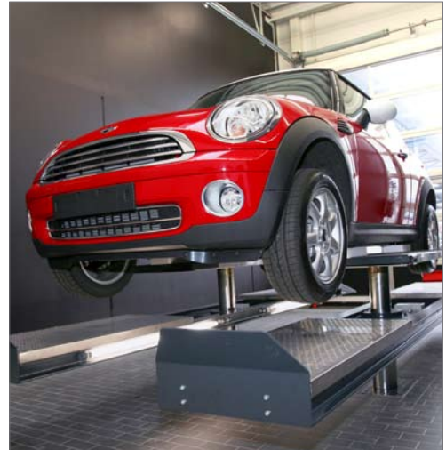
Car Reception Bay for Mini

The surface out of corrugated stainless steel protects the lift against corrosion and has an appealing appearance. The reinforced profiles of the runways' frames increased the stability of the lift.