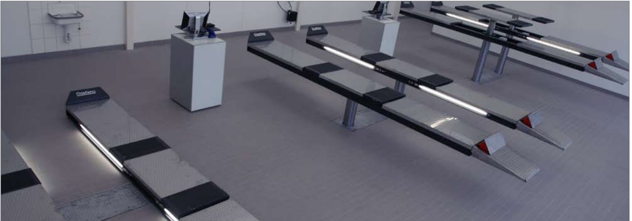
In the car reception, we have 4 in-ground lift of the typ Top Lift 2.35 TSAP