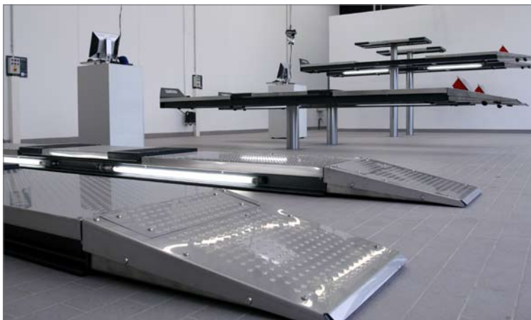
drive-on ramp and lighting