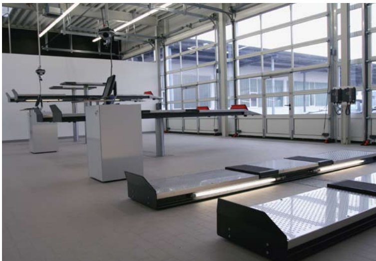
The new 2.35 TSAP in INOX Design with wheel free lift.

The Top Lift 2.35 TSAP is a 2-pistons-lifts with flat runways and an integrated adjustable wheel-free lift. The lift and wheel-free lift have a lifting capacity of 3.500 kg. The synchronization works with a galvanized cross-beam in the installation canister which also avoids the rotation of the pistons.