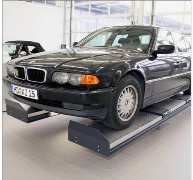
Runways of the Top Lift 2.35 TSAP INOX