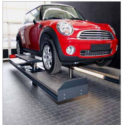
car reception bay and customer dialogue