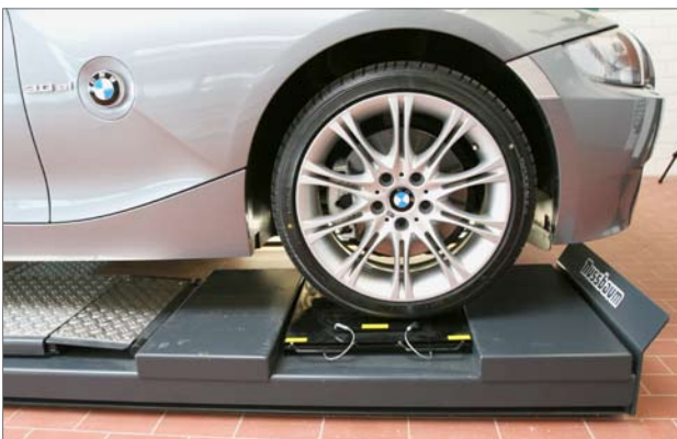
Reusses for turntables and flat plates