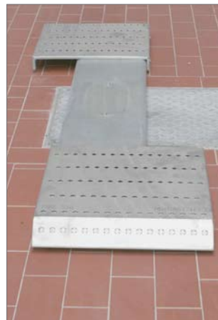
Top Lift 2.35 TS NT with lengthwise and transversally adjustable pick up platform.