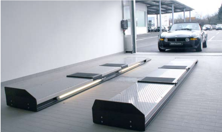
Car Reception Bay