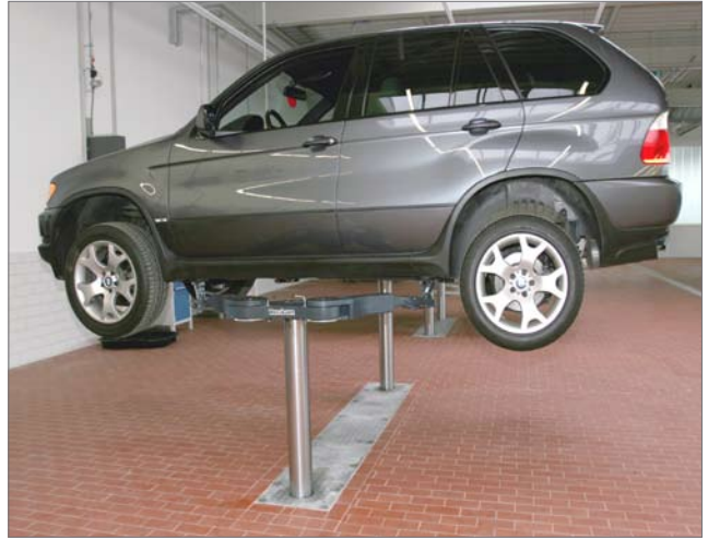
Top Lift 2.35 TSK with Mini Max