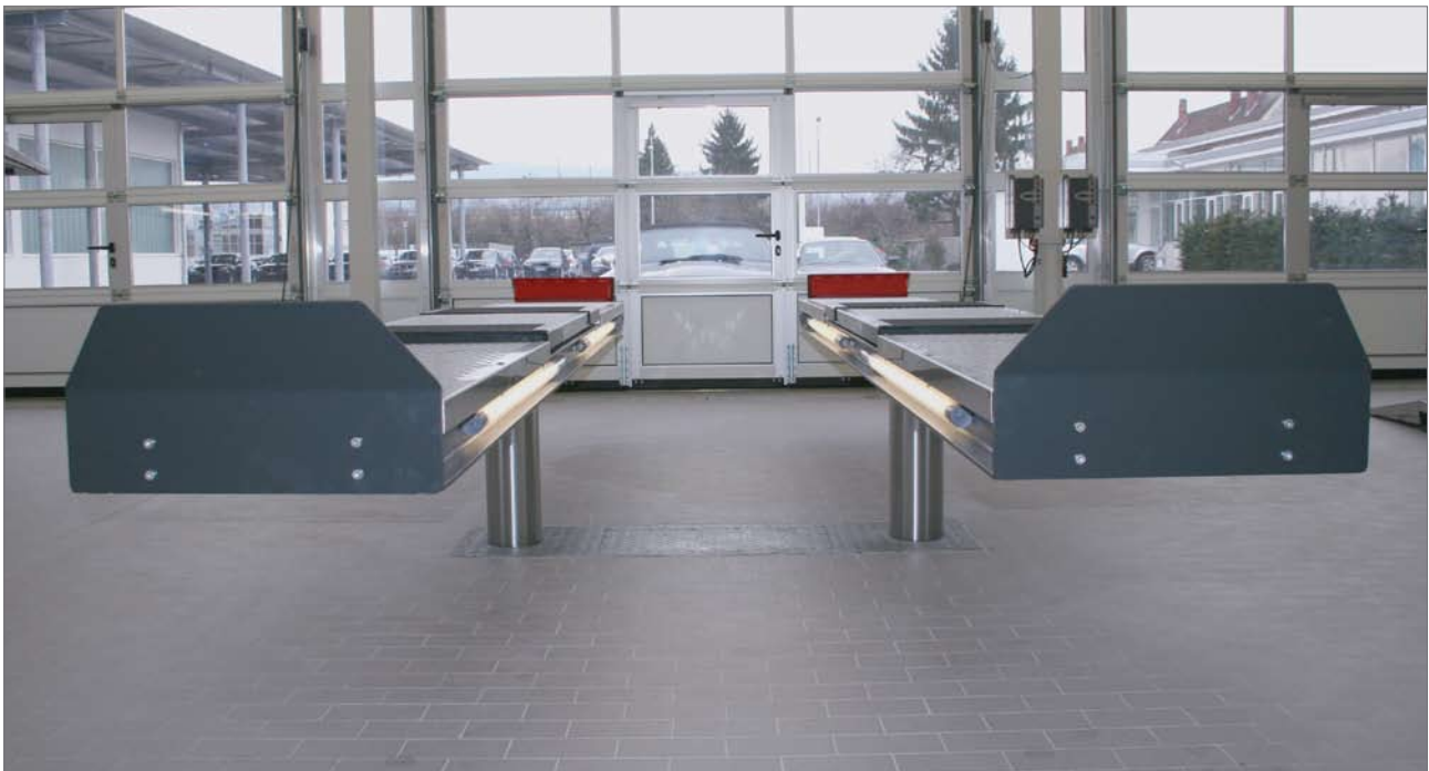
Top Lift 2.35 TSAP INOX Design