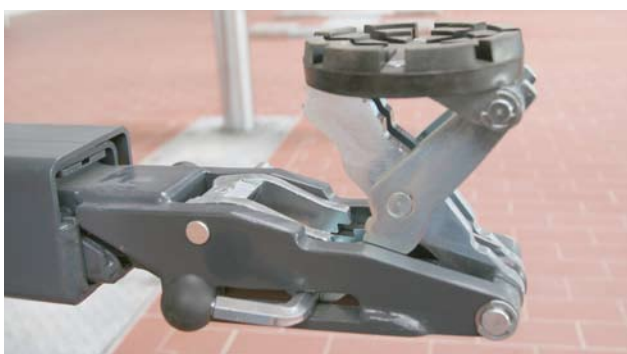
Top Lift 2.35 TSK: telescopic carrying arms with Mini-Max

The In-ground lift is installed with telescopic carrying arms. With the Mini Max you can pick up low profiles vehicles without problems at the pick-up points. Also difficult to reach pick-up points can easily be reached via Mini Max.