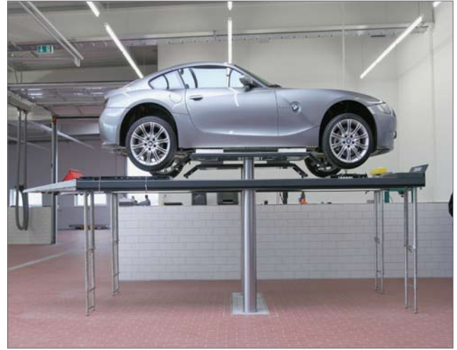
Automotive lift with wheel alignment legs adjustable in 3 positions