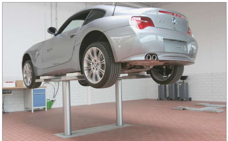
Top Lift 2.35 TS NT

28 in-ground lifts of the type NUSSBAUM Top Lift are installed in the workshop