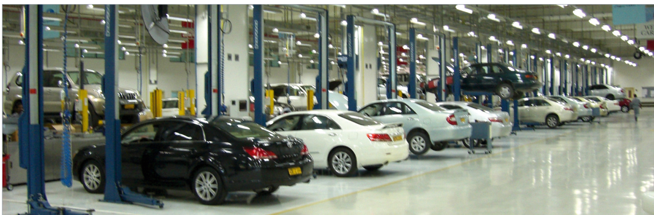
Toyota workshop - Oman is equipped with SPL 4000 und SPL 4000 UNIVERSAL