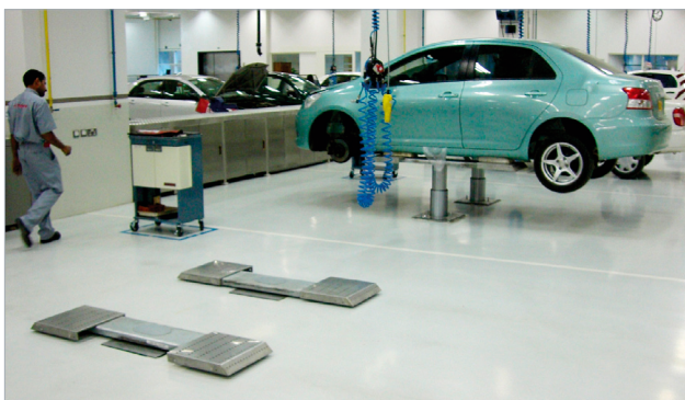
Toyota workshop - Oman is equipped with TOP LIFT 2.35 TS XY