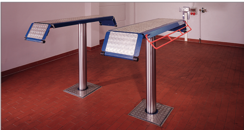
TOP LIFT 2.35 TS STANDARD

From NUSSBAUM developed and manufactured in Germany in-ground lift, can be found in all working areas of workshop, thanks its application.