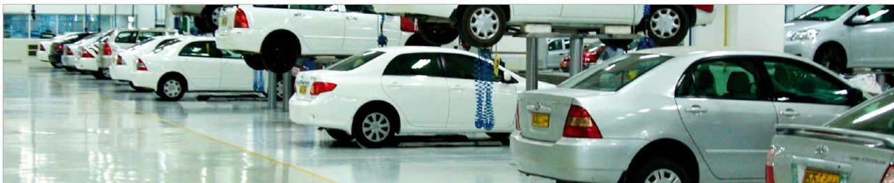
Toyota workshop - Oman