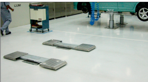
TOP LIFT 2.35 TS XY

The fire galvanized lifting platform of the TOP LIFT 2.35 TS XY is lengthwise and transversally adjustable.