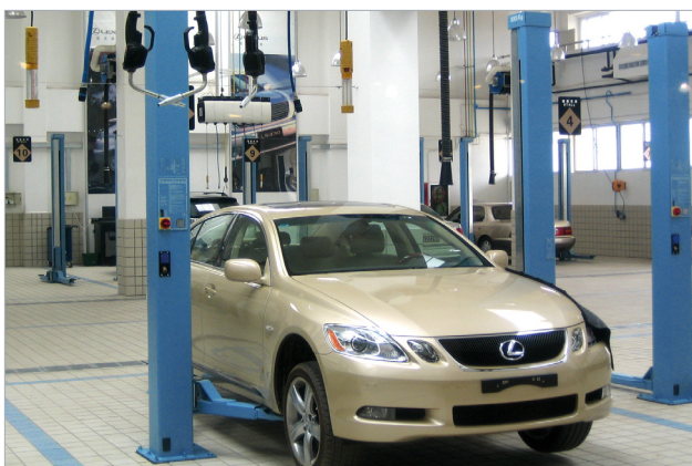
LEXUS workshop - China is equipped with SMART LIFT 2.30 SL