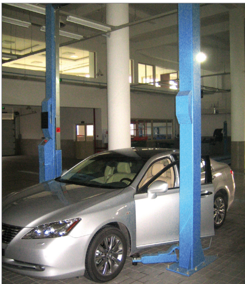
POWER LIFT SPL 4000 UNIVERSAL