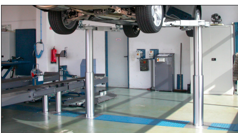
TOP LIFT 2.35 TTL K SST

The TWO TELESCOPIC PISTON LIFT has no mechanical connection. Its low installation depth is only 1605 mm - ideal for installation in region with high groundwater level. The lift is available with standard lifting arms, which are equipped with adjustable pick up pads.