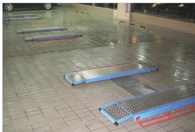
LEXUS workshop - China is equipped with TOP LIFT 2.35 TS STANDARD