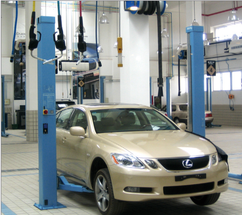
SMART LIFT 2.30 SL with standard lifting arms