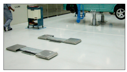
TOP LIFT 2.35 TS XY