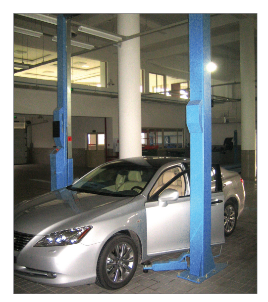
POWER LIFT SPL 4000 UNIVERSAL