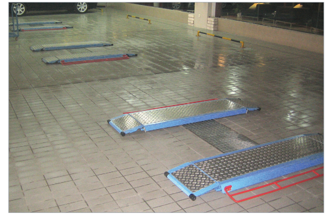
LEXUS workshop - China is equipped with TOP LIFT 2.35 TS STANDARD