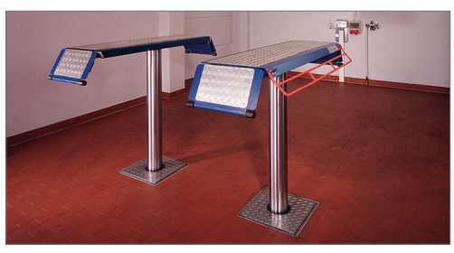
TOP LIFT 2.35 TS STANDARD