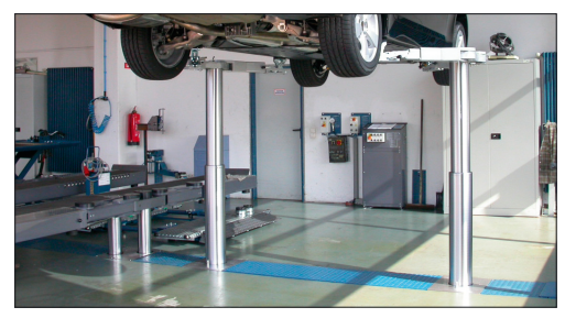
TOP LIFT 2.35 TTL K SST

From NUSSBAUM developed and manufactured in Germany inground lift, can be found in all working areas of workshop, thanks its application.