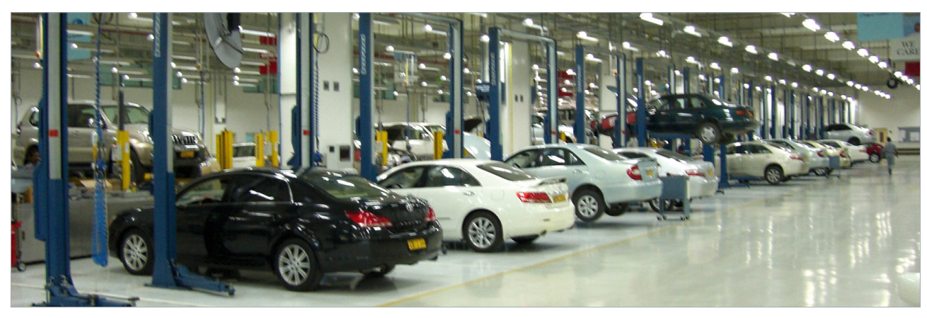
Toyota workshop - Oman is equipped with SPL 4000 und SPL 4000 UNIVERSAL