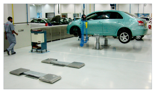
Toyota workshop - Oman is equipped with TOP LIFT 2.35 TS XY